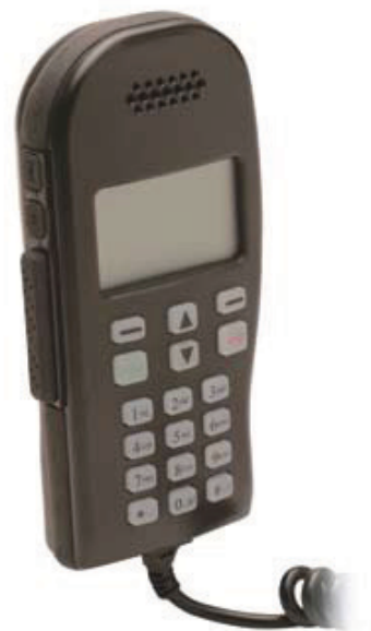
DT-200 Series Handset