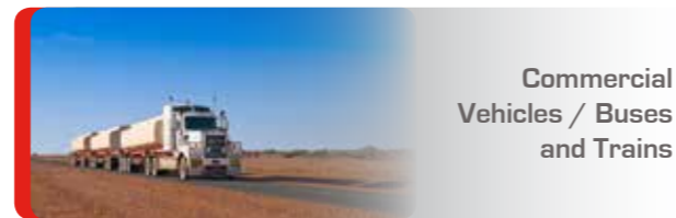
Commercial Vehicles / Buses and Trains