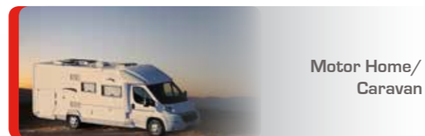
Motor Home/ Caravan