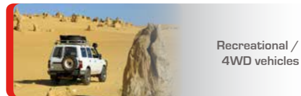
Recreational / 4WD vehicles

IsatDock DRIVE also supports the use of an optional active privacy handset, that can be easily added to the IsatDock DRIVE.