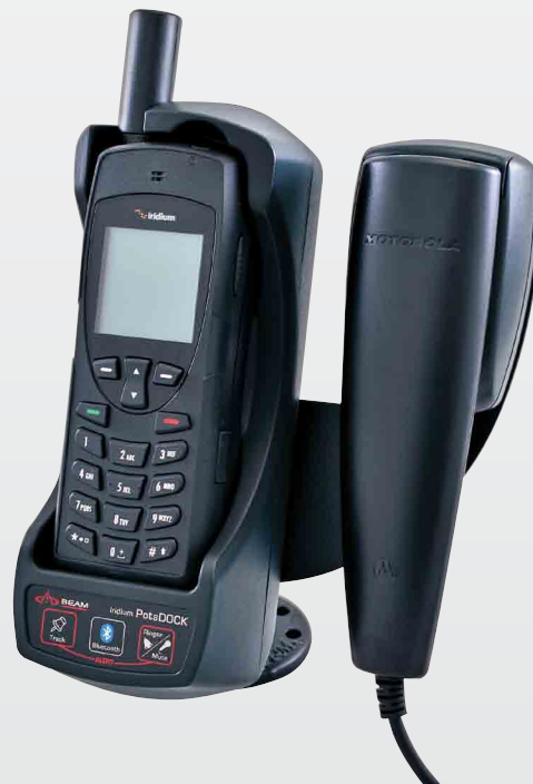
PotsDOCK 9555 with optional Privacy Handset